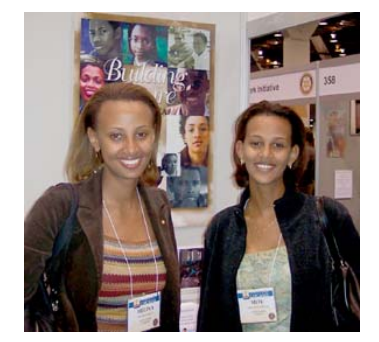
Sisters from Ethiopia, eager to take Youth IT home.

life that is satisfying and peaceful. There are many well-educated Africans with access to water, food and health care but they still can not find jobs! So they migrate to Europe and America: we now have 1-million African immigrants in the U.S.! And they brought their education and skills with them, all desperately needed in Africa. Who can blame them? My parents emigrated from Sweden to find a better future in America.