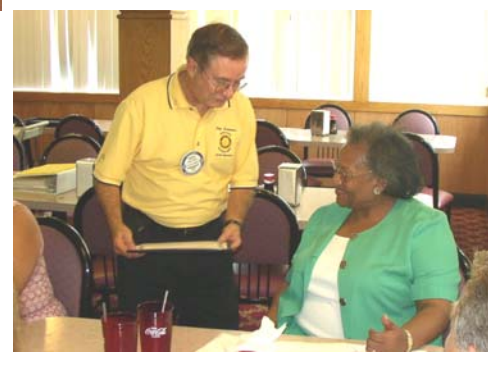
The Rotary Club of Azusa felt very rewarded to have been able to participate in the sea going field trip and hope to have a repeat next year.

AZUSA FIELD TRIP PROJECT IS COALITION OF APU AND Azusa USD With A Little Help From Azusa Rotary!