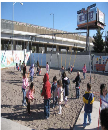
Children back at play (NALA) 1/25/07