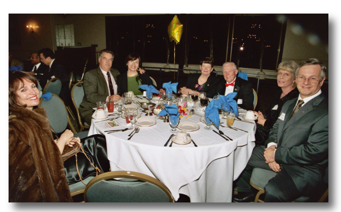
Rotarians and their spouses from the West Covina Club.

The Pasadena Rotary Club recently partnered with the Open World program to bring a delegation of five Russian social service professionals to meet with local non-profit organizations.