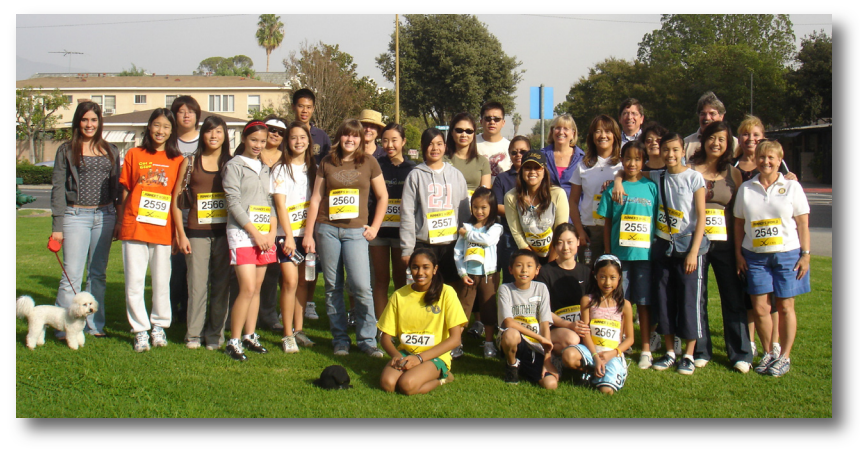
Arcadia Junior Interact Club w/ support of Rotarians, friends & family before the 5-mile walk-a-thon event around Arcadia County Park to raise money for the project.

The Arcadia Junior Interact Club, sponsored by the Arcadia Rotary Club, has raised $1,615 for a clean water project in Accra, Ghana, West Africa. The project will provide boreholes fitted with electric pumps and water storage tanks for a local school for disabled children and six surrounding villages. The club raised the funds with their annual walk-a-thon in November.