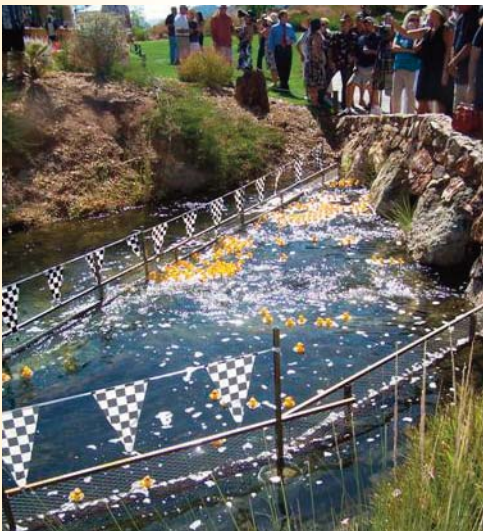
And here they come, down the stream and under the bridge, 1500 yellow racing ducks paddling to be first to reach the catcher.