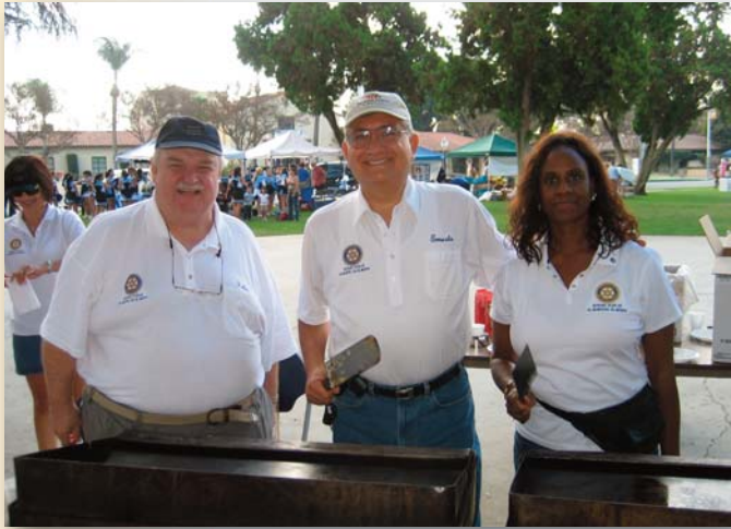
Members of the club at the breakfast

El Monte/South El Monte Rotary held its Annual Pancake Breakfast at the end of the Children's Day