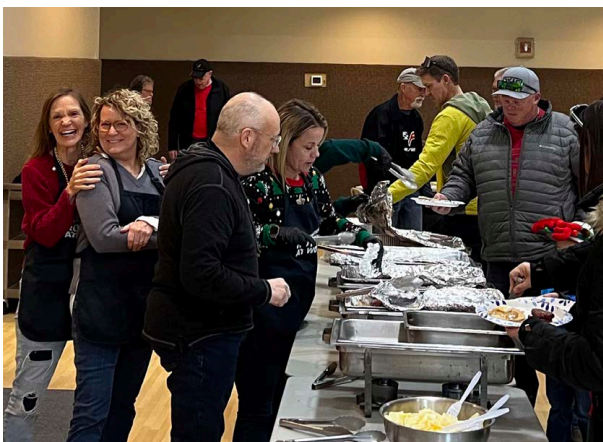
The Pancake Breakfast is a long tradition for us to serve prior to the Christmas Parade. Serving line at left, below is the very early crew at Stu's kitchen.