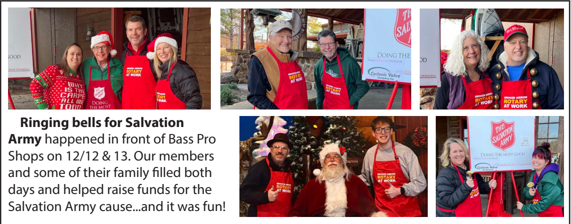
Ringing bells for Salvation Army happened in front of Bass Pro Shops on 12/12 & 13. Our members and some of their family filled both days and helped raise funds for the Salvation Army cause...and it was fun!

More photos on pages 3 & 4 and on Facebook.