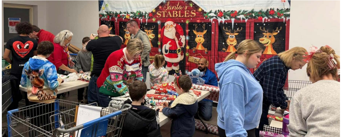
Shop With a Rotarian was held on 12/14. After the shopping was completed, the wrapping began. The setup and supplies donated by Walmart were perfect! Broken Arrow Neighbors arranged for the families who needed this help.

Shop with a Rotarian was a great success for our club members and the community!