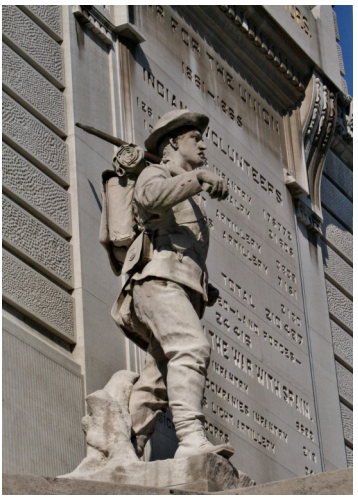
Spanish-American War soldier on the beautiful Soldiers & Sailors Monument (above), USS Indianapolis Memorial (below left), Veterans' Memorial Plaza (below right)