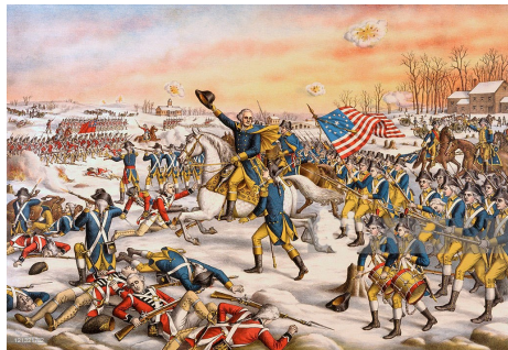
George Washington leads his troops in battle at Princeton, NJ

248 years ago, General George Washington and units of his Continental Army began 1777 on an auspicious note. Following on the Continental's December 26, 1776 victory at the Battle of Trenton, for which George Washington and his army "Crossed the Delaware" (see p. 2), the Americans