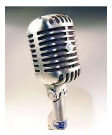
March - April Speaker Schedule

One of Mandarin Rotary's strongest features - SPEAKERS List of Speakers, Newsletters, Calendars, Events, and Meeting information is always updated at <u>MandarinRotary.org</u>